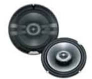
KFC-1690ie MAX POWER 250W 6-3/4" 2-way Flush Mount Speaker System