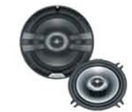
KFC-1390ie MAX POWER 180W 5-1/2" 2-way Flush Mount Speaker System