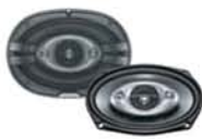
KFC-6970ie MAX POWER 400W 6" x 9" 4-way Flush Mount Speaker System