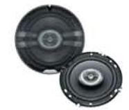
KFC-1680ie MAX POWER 240W 6-1/2" 2-way Flush Mount Speaker System