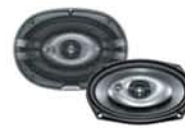
KFC-6960ie MAX POWER 300W 6" x 9" 3-way Flush Mount Speaker