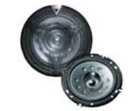
KFC-1650S MAX POWER 160W 6-1/2" Dual Cone Flush Mount Speaker System