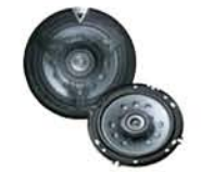
KFC-1660S MAX POWER 170W 6-1/2" 2-way Flush Mount Speaker System