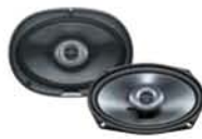
KFC-6990ie MAX POWER 400W 6" x 9" 2-way Flush Mount Speaker System